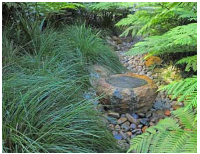
Cutstom made water features provide focal points