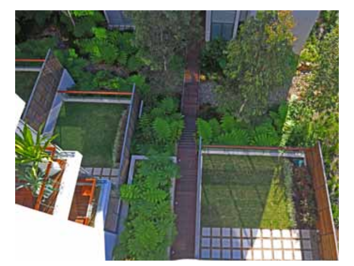
Aerail view: Courtyard treatments provide useful private space