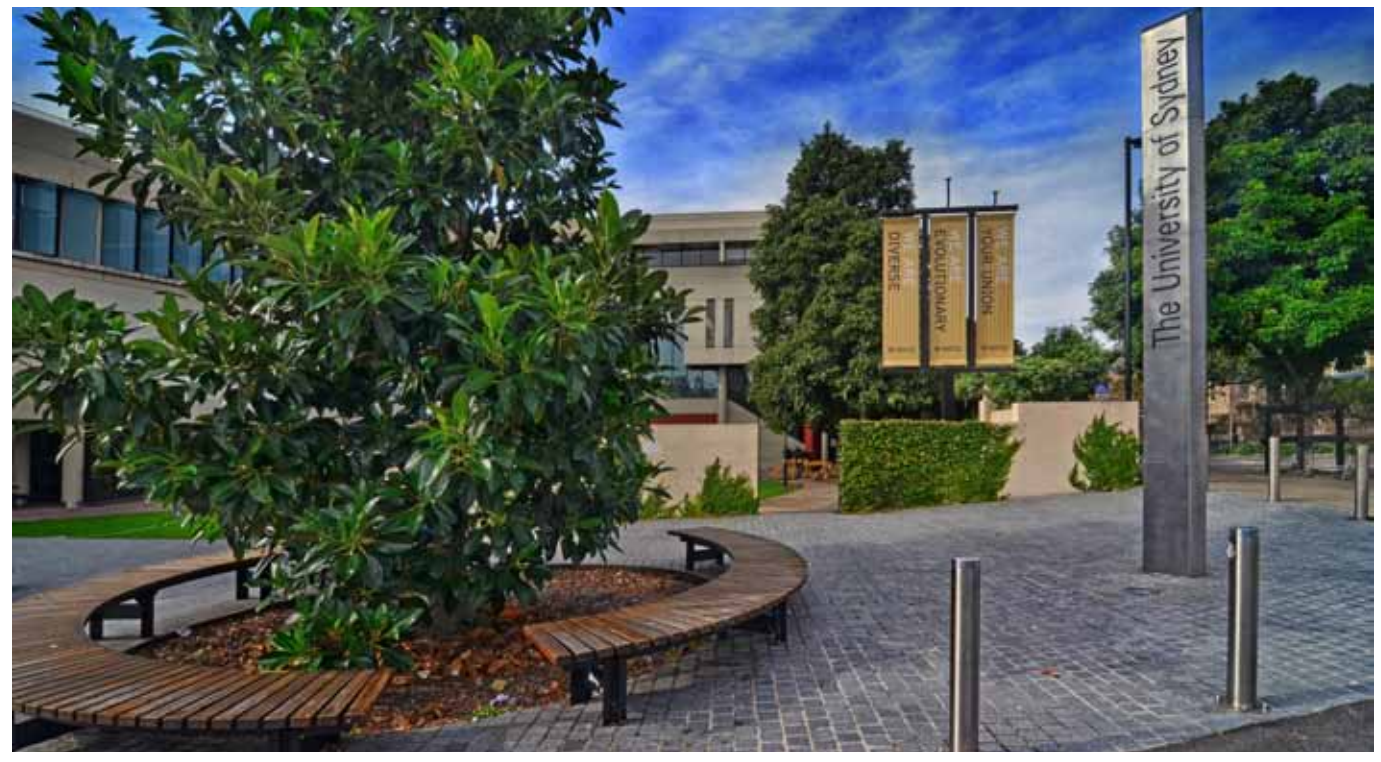
City Road Frontage

Wentworth Building 2008-2009 Universy of Sydney