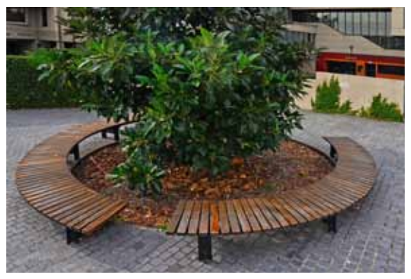
Custom circular bench

Planting, walls and level changes are used to form and divide spaces, creating discrete and separate areas within the courtyard.