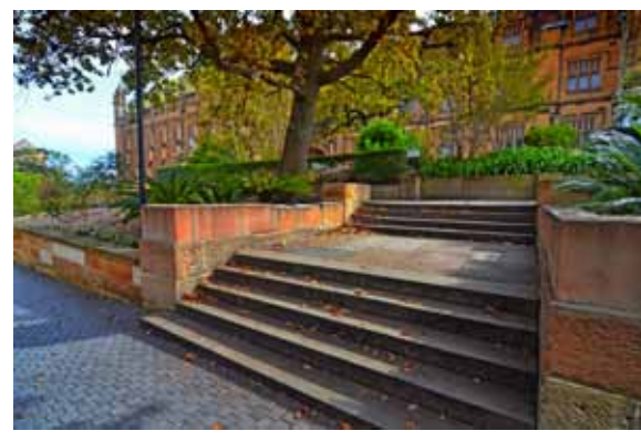
Retaining wall and stairs

The historic avenue plantings of Jacarandas were strengthened with advanced specimens. Plantings in context with historic university species were selected including Camellias, philodendrons, cycads, calatheas, gingers and ivy.